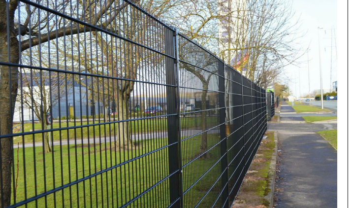
Proposed weldmesh (1.8m)