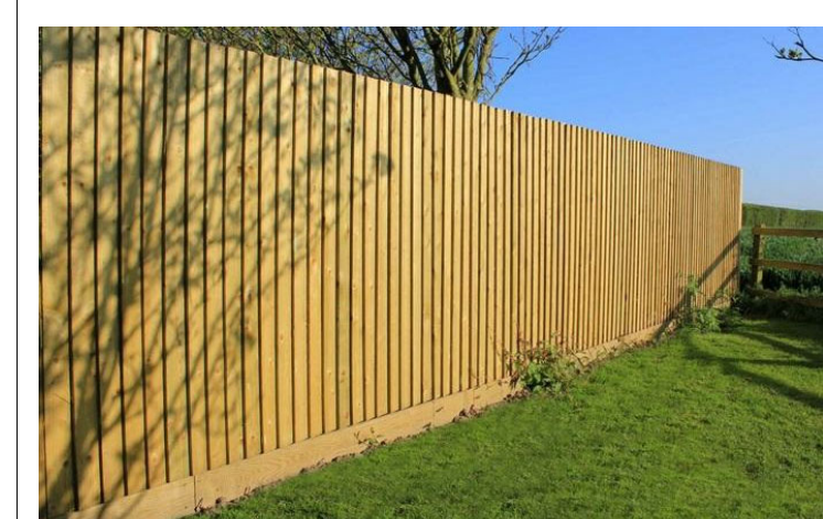
Propsoed timber close boarded fence (1.8m)

Proposed weldmesh double gate (1.8x4.2m)