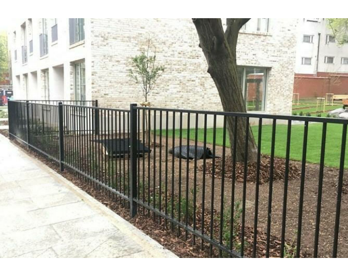
Propsoed vertical bar fence (1.2m)